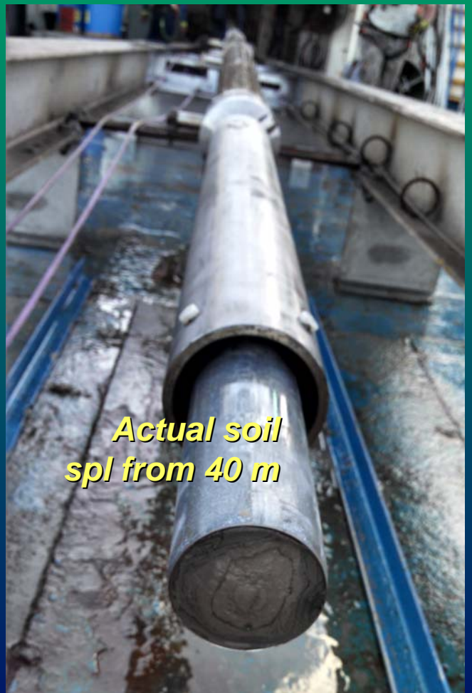
Actual soil spl from 40 m