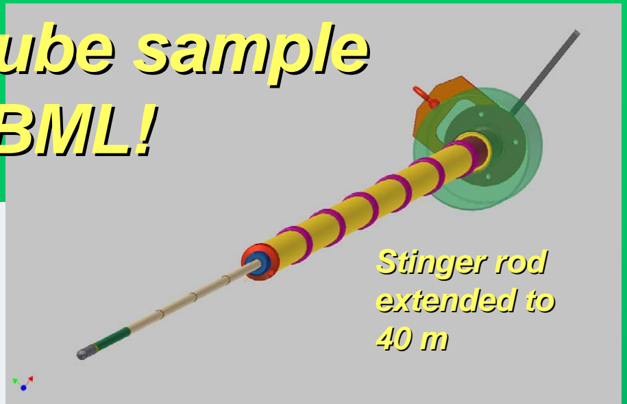
Stinger rod extended to 40 m